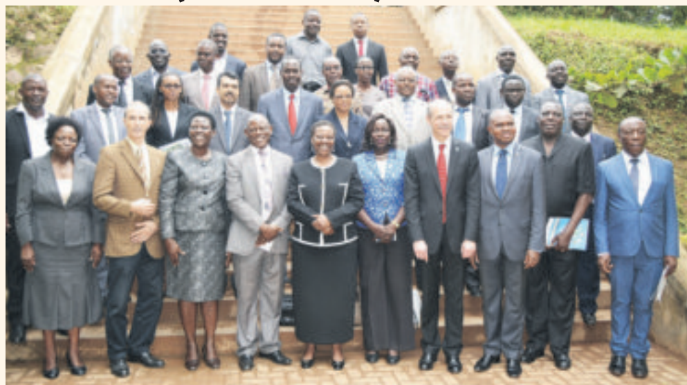
Minister Irene Muloni (middle) and other delegates during the launch of EACREEE on June 11, 2016 at CEDAT Makerere

KAMPALA, 11 June 2016 – In line with the 33 rd Meeting of the Council of Ministers of the East African Community (EAC), a Centre of Excellence for the East African Centre for Renewable Energy and Energy Efficiency (EACREEE) was inaugurated today in Kampala by the Hon. Minister designate, Irene Muloni, Ministry of Energy and Mineral Development of Uganda.